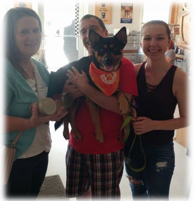
Rigby , adopted under the PHS Veterans Adoption Program in July 2017.

PHS offers a "Seniors for Seniors" Program, where adoption fees are waived for Seniors adopting a pet of 7 years of age and older.