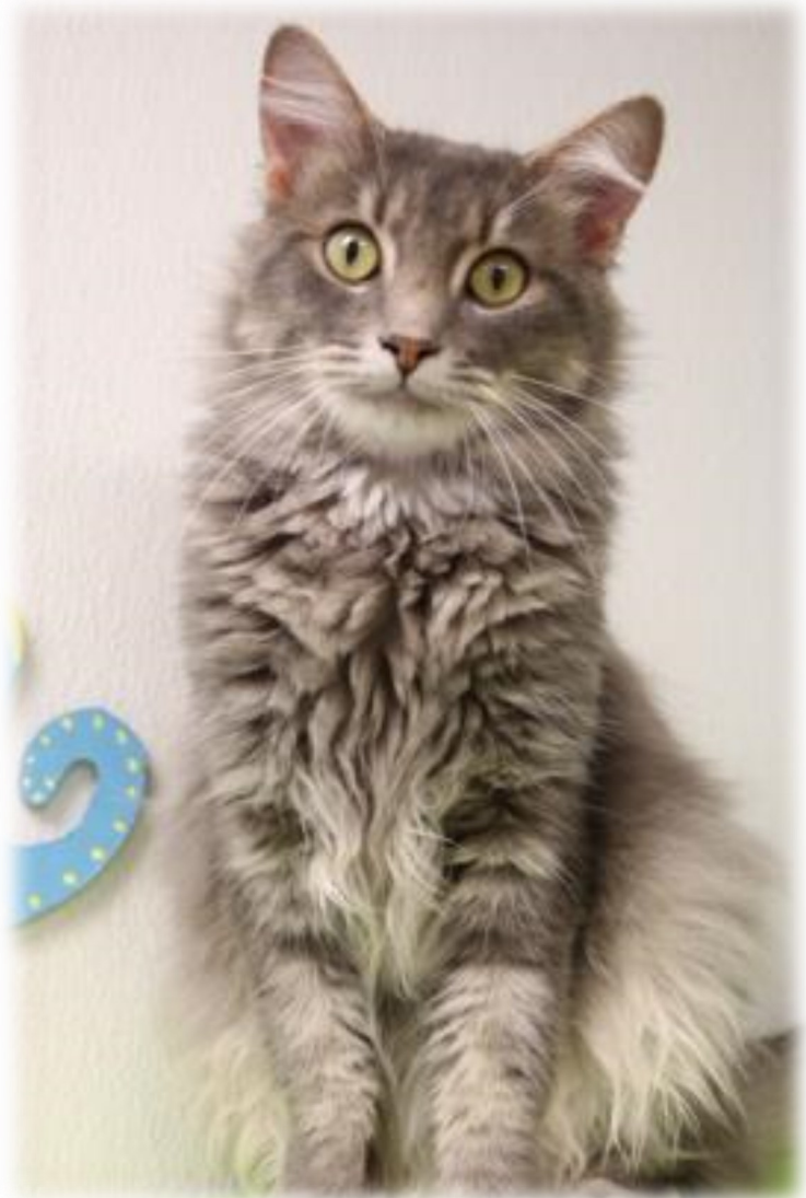
Charlie, Adopted September 2017.