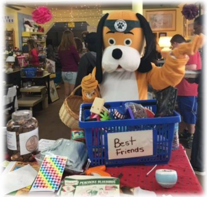
Thrifty , the Best Friends Thrift Shop mascot, promotes a Labor Day Sale at the store.

The Best Friends Thrift Shop is always looking for volunteers to help in various ways to help! If you have some free time and looking for a friendly, social environment, we would love some help!